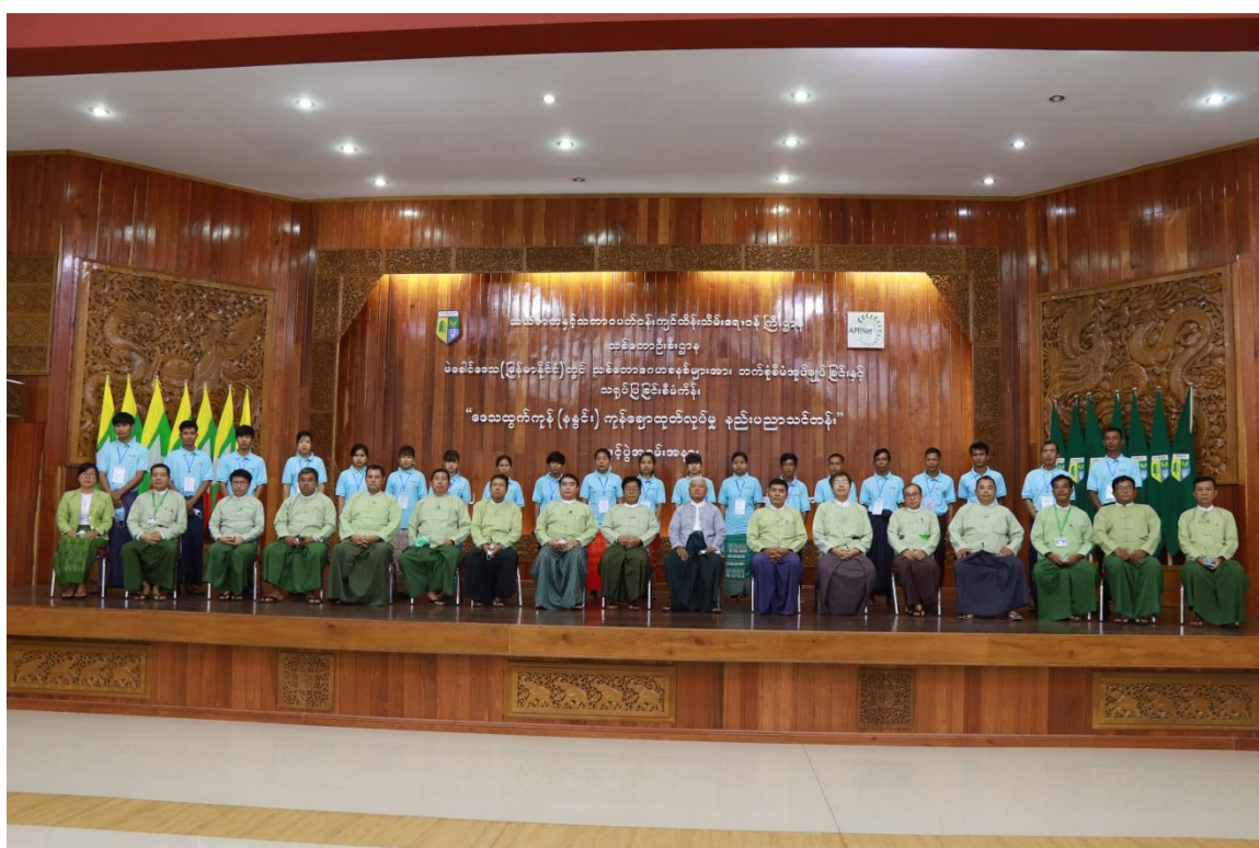
Invited Persons, Trainers and Trainees at the Opening Ceremony