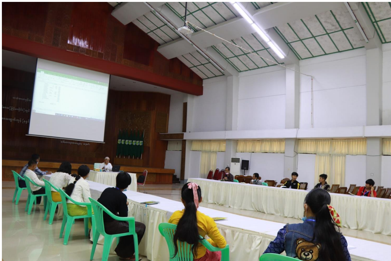
Teaching the steps of grinding turmeric powder (lecture)