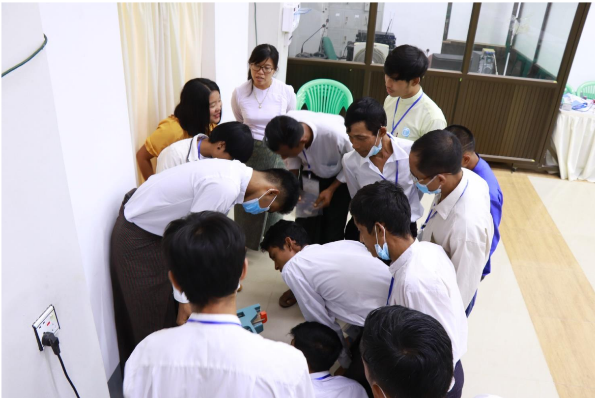
Steps of packaging for sale in the market.