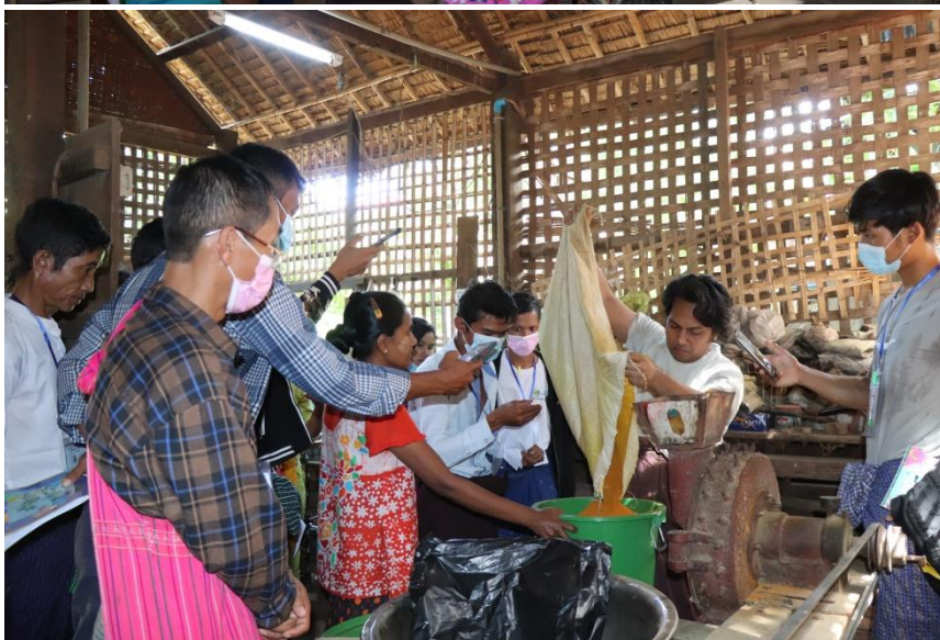
Teaching the steps of grinding turmeric powder (practical)