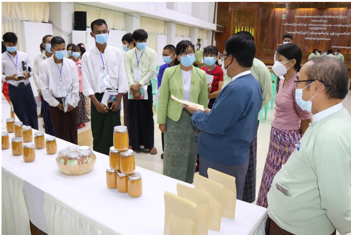
Display at Closing Ceremony