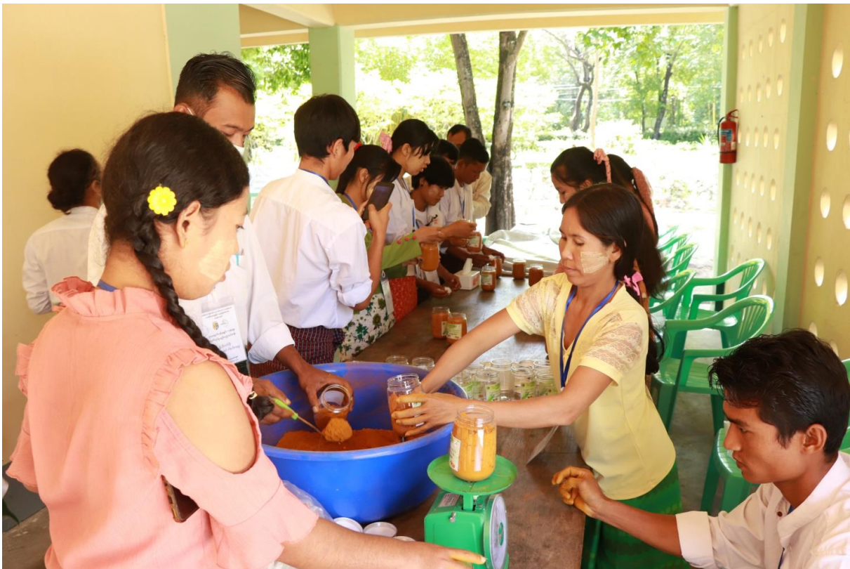
Steps of packaging for sale in the market.